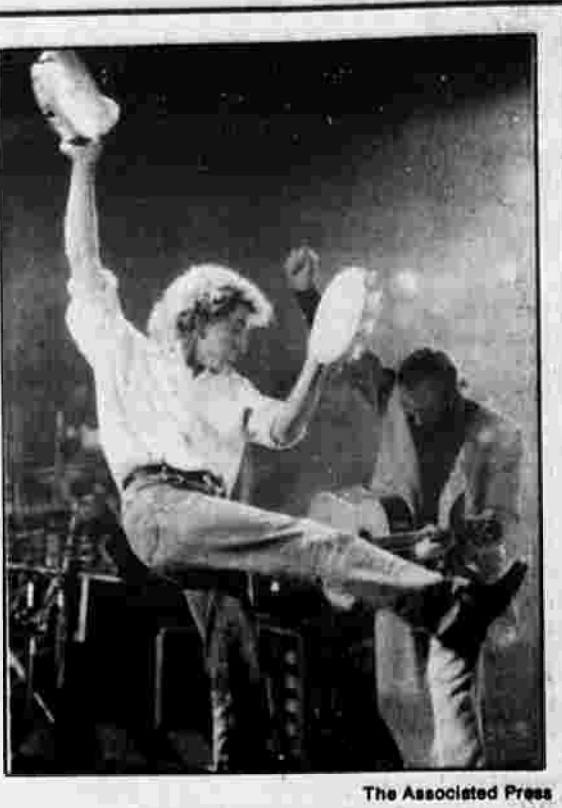
THE WHO RETURNS - Roger Daltry, the Who, and Pete Townshend perform in Glen Falls, N.Y., Wednesday in a preview of The Who's 25-city tour to mark the band's 25th anniversary.

Dear Abby's Cookbooklet is a collection of favorite recipes - all tested, tried and terrific! To order, send your name and address, plus check or money order for $3.50 ($4 plus shipping). Send to: Abby's Cookbooklet, P.O. Box 447, Mount Morris, Ill. 61054. (Postage is included.)